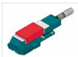
Clamping field O2