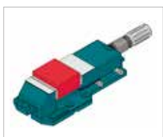
Clamping field O1