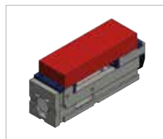
Clamping field O3