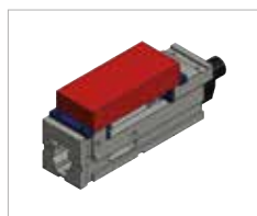
Clamping field O2