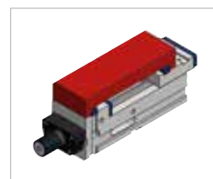
Clamping field O4