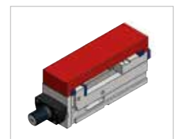
Clamping field O5