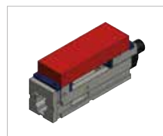
Clamping field O3