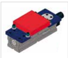
Clamping field O1