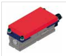
Clamping field O2