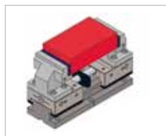
Clamping field O2