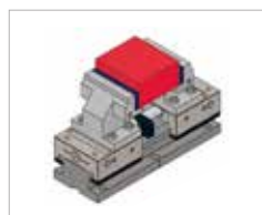
Clamping field O1