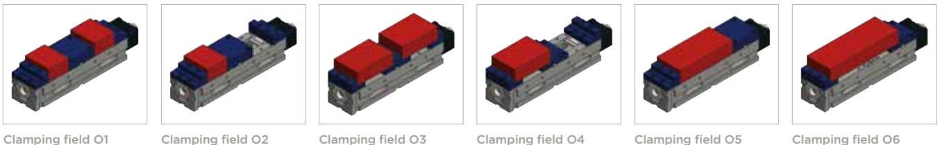
Clamping field O1